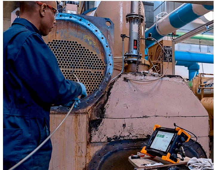
Figure 5: Reddy AC heat exchanger tube inspection.