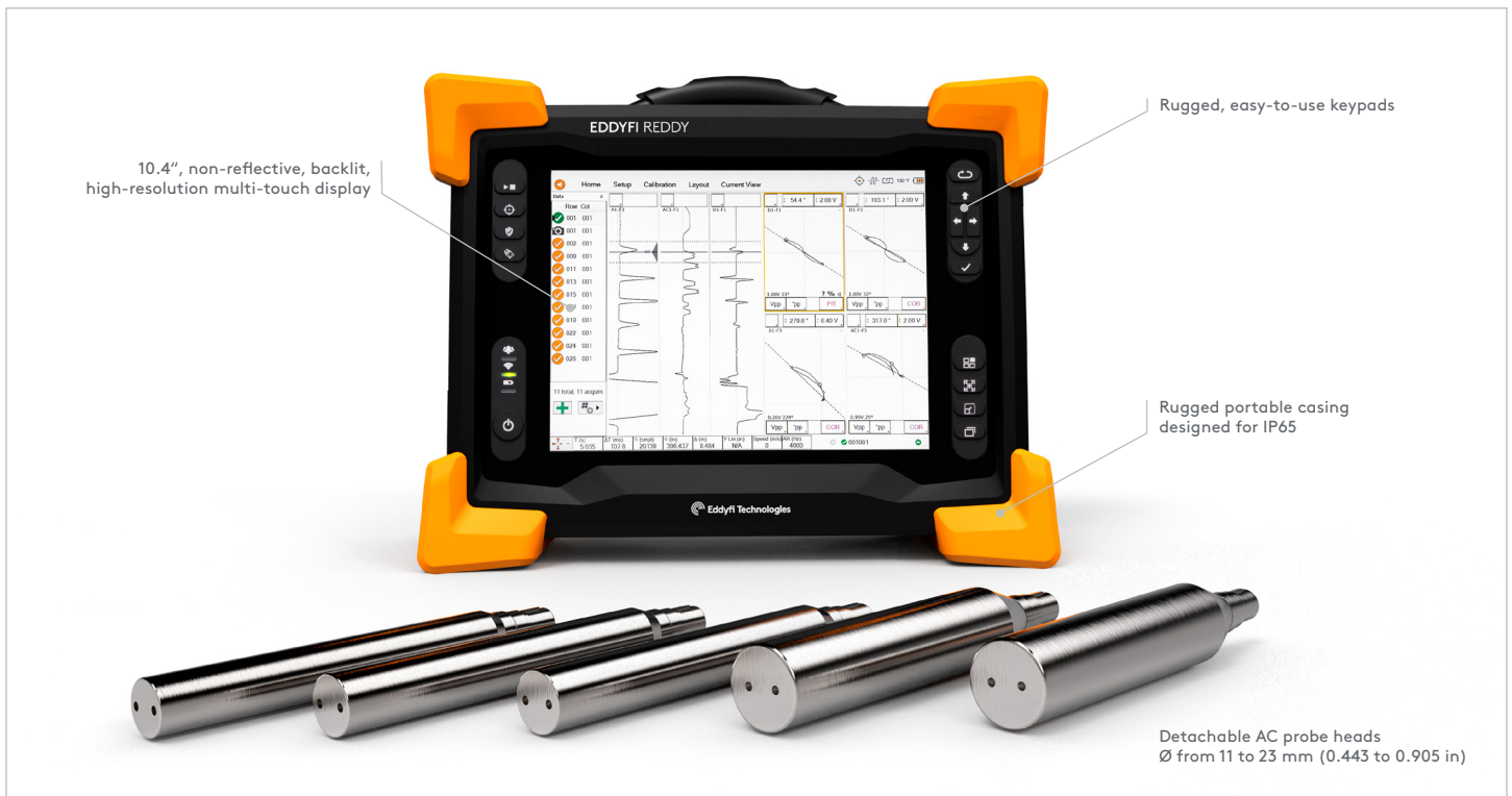
Figure 1: Annotated breakdown of Reddy showing its key features.