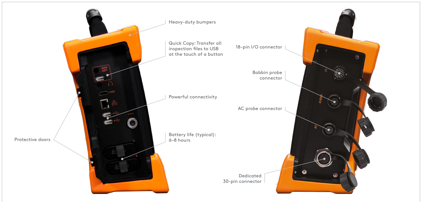
Figure 3: Annotated breakdown of Reddy showing its key features.