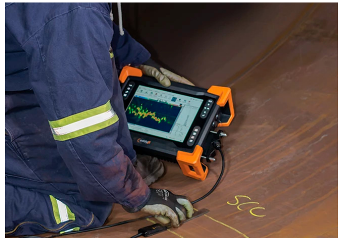
Figure 5: Detecting and assessing stress corrosion cracking in base metal using I-Flex™ paired with Reddy.