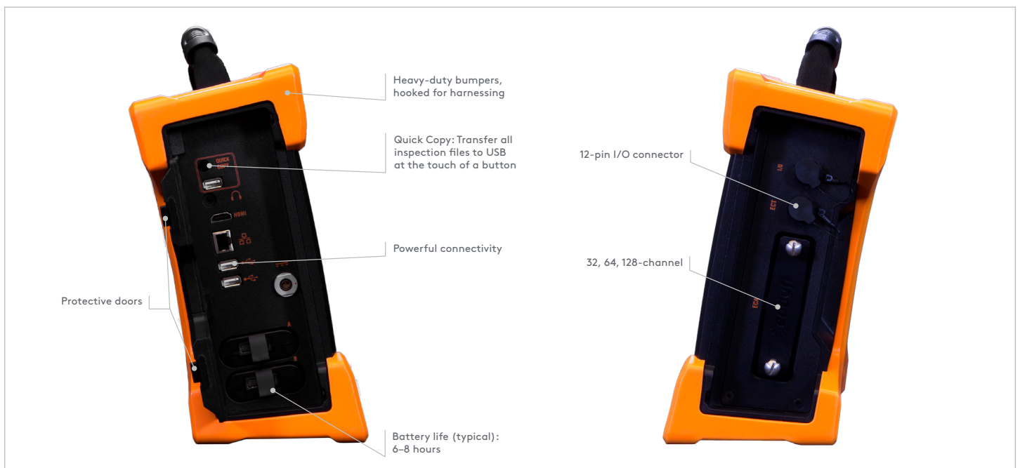
Figure 3: Annotated breakdown of Reddy showing its key features.