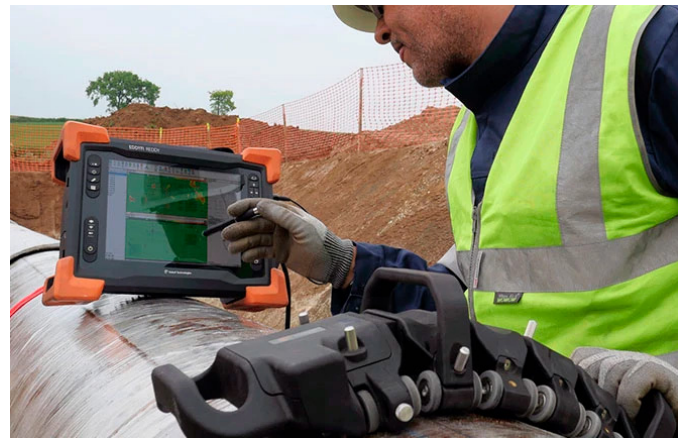
Figure 4: Ditch pipeline inspection using Sypne™ paired with Reddy.

If these standard probes don't meet your specific requirements, you can still leverage the full might of Reddy—Eddyfi Technologies experts can design custom probes to suit your exact needs.