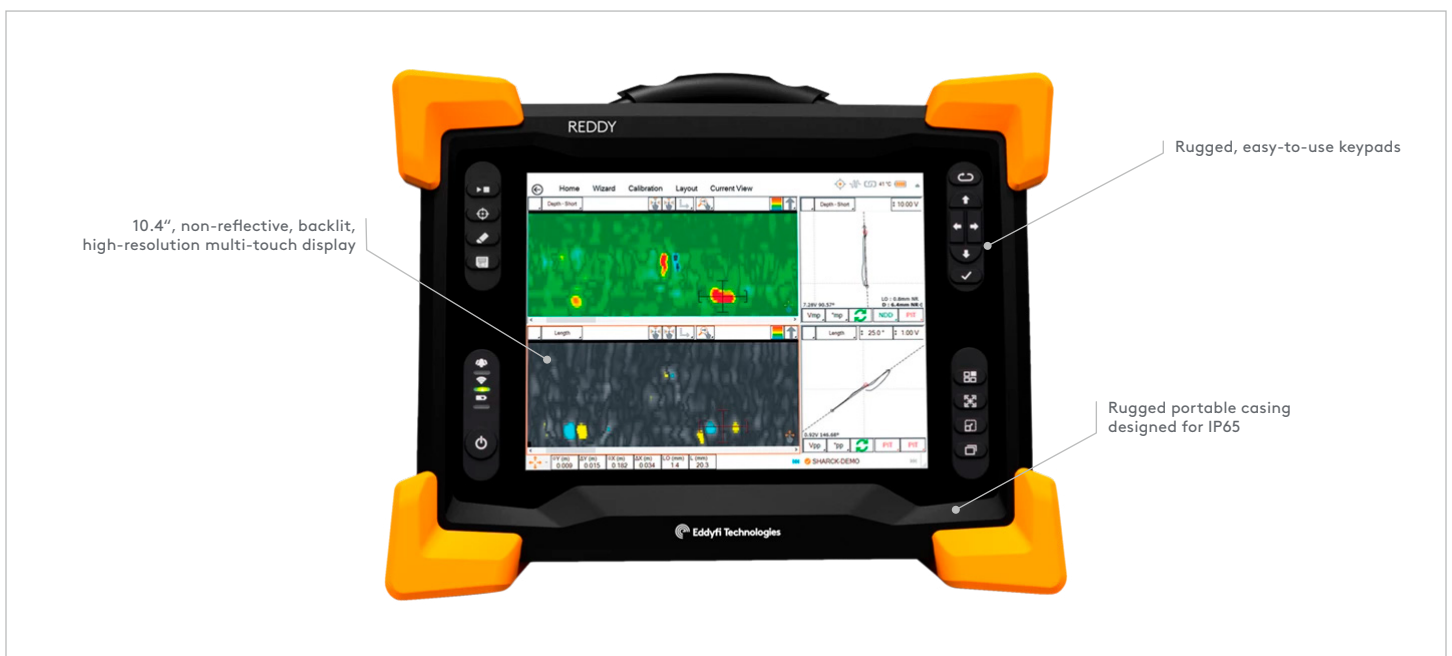
Figure 1: Annotated breakdown of Reddy showing its key features.